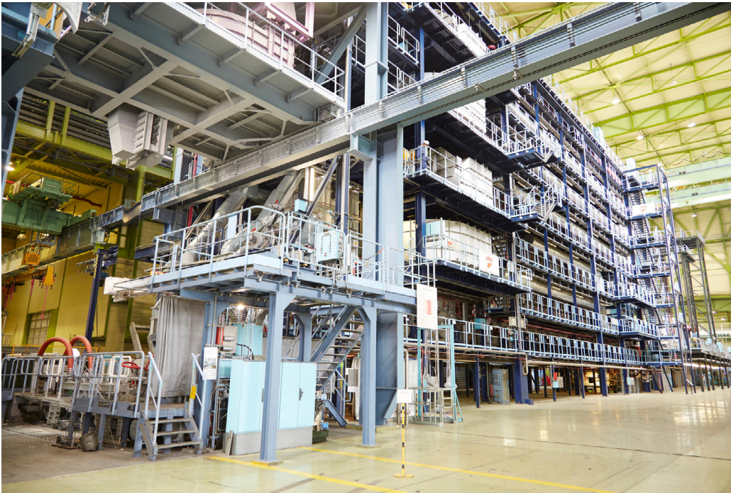
Figure 1: A galvanizing line.

Accurate strip temperature must be maintained to produce high-quality products, and in this controlled and varied environment, production engineers and technicians have two broad choices for feedback: thermocouples, which measure conditions via contact temperature measurement and heat conduction, and non-contact sensors, which measure temperature indirectly through radiated heat energy, primarily in the form of infrared radiation.